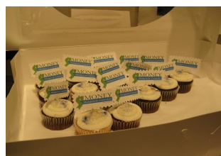
2014 Trolley Tour Photos